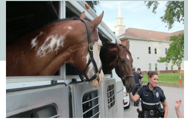
Virginia Beach Police Mounted Patrol was a big success with the kids.